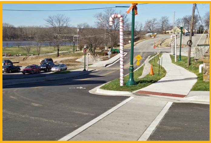
Crosswalk, bike lane, wide sidewalks and curb ramp.

Work commenced on miles of paved and non-paved biking and walking trails which capitalized on the extensive levee system on both Lake of the Ozarks and the Truman Lake area.